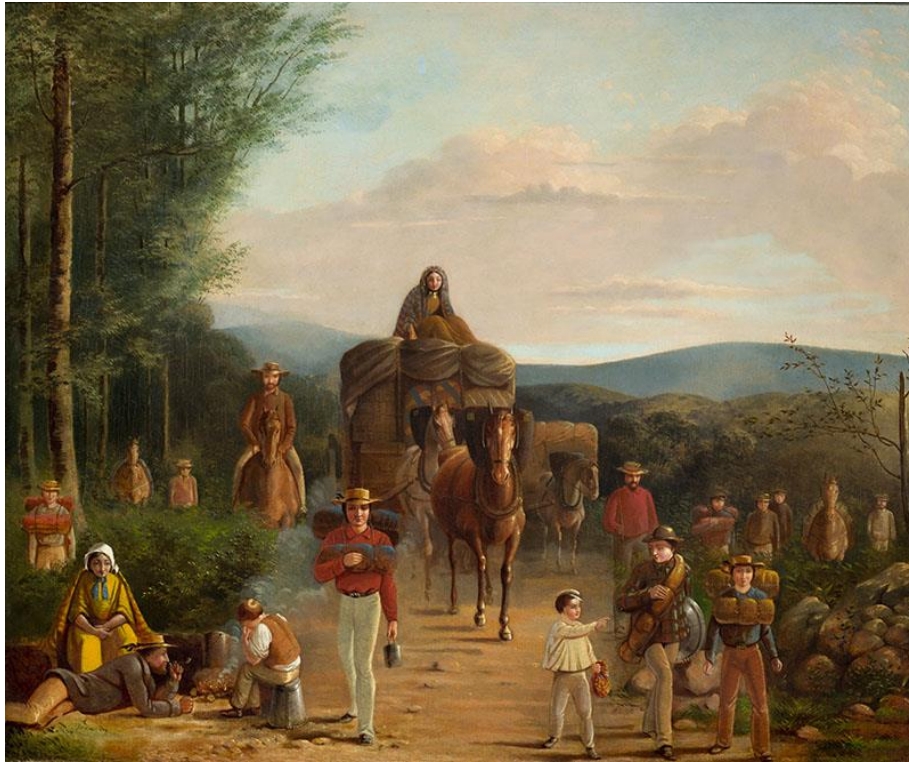
Albertus del Orient Browere, Gold Prospectors , 1858

Alternate History is a great genre to ask the question What if? Typically, the genre takes a well-known historical event and applies a What if? scenario to it. This tactic is called the hinge point, point of divergence, the Jonbar point, or simply 'the hinge'. The hinge alters the known flow of history, exploring new outcomes of an event(s). With the help of a few paintings, we'll practice using the hinge in our scenes.