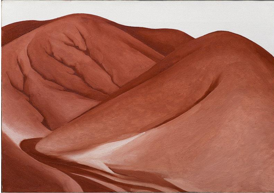
Georgia O'Keeffe, Red Hills, Grey Sky , 1935

Georgia O'Keeffe has been called the "Mother of American Modernism". One aspect of modernism is embracing subjectivity (emotions, opinions, perceptions) while making art. Make a list guessing what Georgia's mood might have been while creating both paintings. Now, what if she painted these red hills using a different mood? What if her internal perception of this church shifted? If the hinge point is Georgia's imaginative mood, how might these paintings transform? Describe their change from what we see here to a new reality.