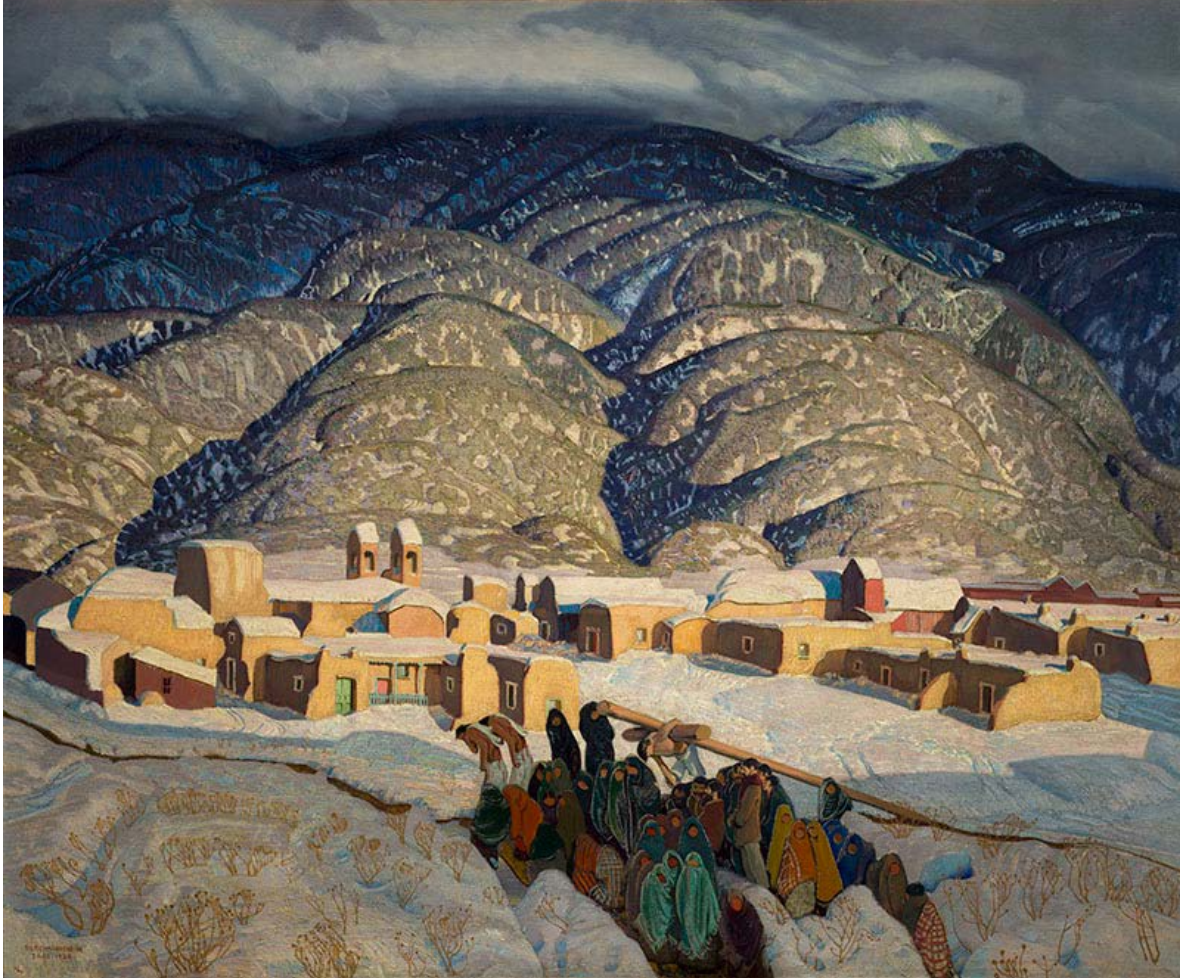
Ernest Blumenschein, Sangre de Cristo Mountains , 1926.