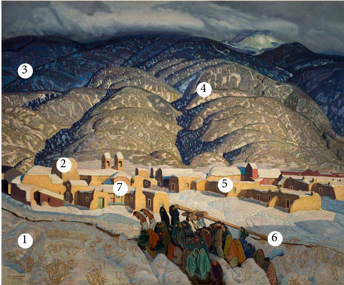
Ernest Blumenschein, Sangre de Cristo Mountains , 1926.

Notice the composition in this painting. Pay attention to the foreground (1), middle ground (2), and background (3). If you divide the painting into sections based on subject matter, you find the foothills and the mountains behind them make up approximately 50% of the composition (4), the village makes up about 25% (5), as does the foreground genre scene of villagers (6). Think about the style of the painting, and take a look at the way the artist used paint, brush strokes, and color (7).